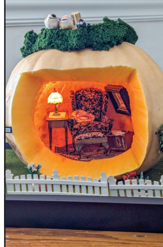
Third Place: Stonehenge Senior Living of Blairsville, GA