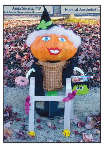
Second Place: Synergy Health Inc. of Hiawassee, GA