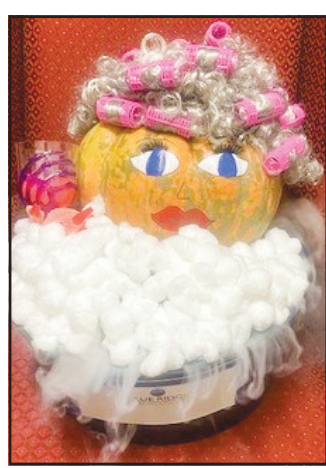
First Place: Ridge Assisted Living and Memory Care of Blue Ridge, GA

All contestants did an excellent job decorating their pumpkins. It was very hard to choose just three from the entries. Thank you to all who participated.